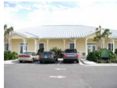
Central Park - example of design standards

Harbor Walk Project - the Board of County Commissioners approved a contract with Kimley Horn and Associates to finalize the design, permitting and construction plans for Phase IB of the Harbor Walk project on September 24. The Harbor Walk project is located at the foot of the north-bound US411 bridge and is the signature project for the Charlotte Harbor CRA. Once completed it will enhance pedestrian and bicycle access to Charlotte Harbor and help to stimulate private investment in the area. Phase 1A which includes replacement of the seawall, development of a small boat launch, parking area and restroom is designed and permitted. Funding for Phase IA is included in Florida Department of Transportation work plan for fiscal year 2014/2105. Phase IB which includes a raised boardwalk and fishing pier will provide pedestrian